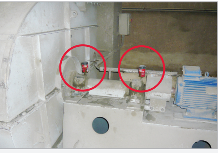
Lubrication of pillow block bearing on a fan shaft