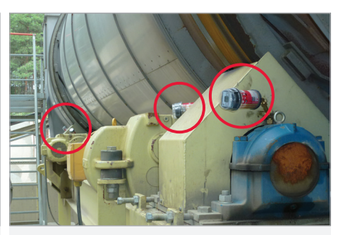
Lubrication of pillow block bearing on a rotary dryer