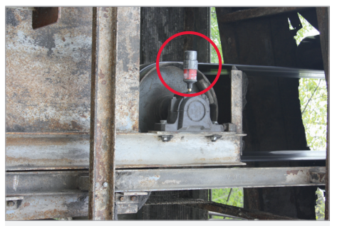
Lubrication of shaft bearing on a conveyor belt drum