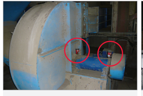
Lubrication of bearing unit on a fan