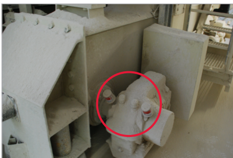
Lubrication on mixer shaft