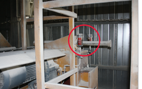
Lubrication of track roller