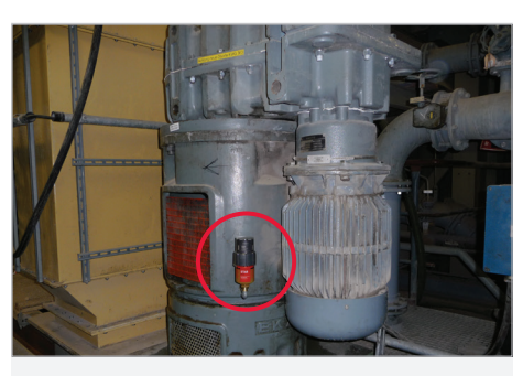
Lubrication of roller bearing on a mixer